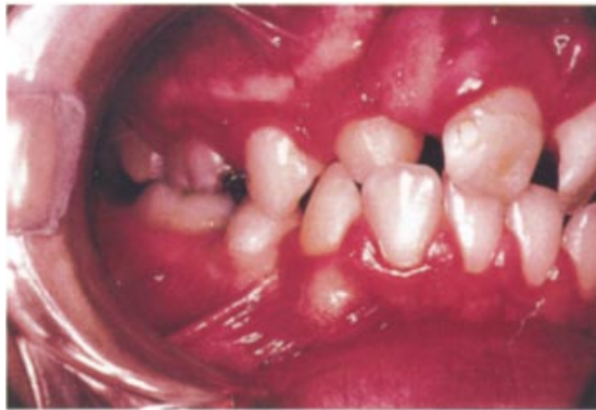
Figure 4 The cleft side prior to treatment.