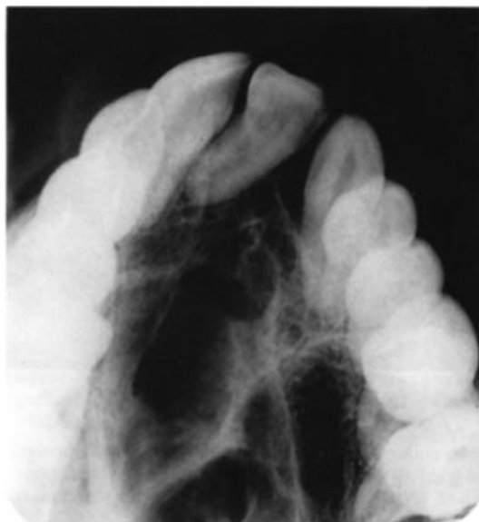
Figure 2 Anterior occlusal radiograph taken of the same patient post-bone-grafting. It shows a successful bone graft with the erupted cleft canine.

in this group. This is in agreement with the work of Bergland et al. (1986) who found less favourable results if grafting was performed after canine eruption.