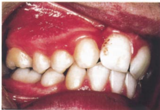
Figure 5 The occlusion on the cleft side after the completion of orthodontic treatment and bone-grafting.

10.5 years. However, the mean age for those with Type III and Type IV grafts was 11.7 and 12.8 years, respectively. Åbyholm et al. (1981) also found a higher failure rate when the osteoplasty was performed late. Waite (1987) explained that younger patients maintain their bone levels more than older patients, as the longer the untreated cleft exists, the more the alveolar bone levels proximal to the cleft resorb. Thus, the final graft height is determined by pre-existing alveolar bone levels.